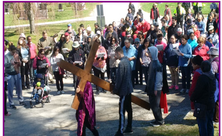
Way of the Cross Walk - April 14, 2017

Please park your vehicles at St. Dominic's Parish on the morning of the Walk. Do not park your vehicles at St. Andrew's Parish. When you arrive at St. Dominic's Parish, please park your vehicle behind the church, close to St. Dominic's Catholic Elementary School. Volunteers will be there to direct traffic and assist you in finding your parking spot. There will be a number of Limousines to take you and your family to St. Andrew's Church between 7:30am until 8:45am.